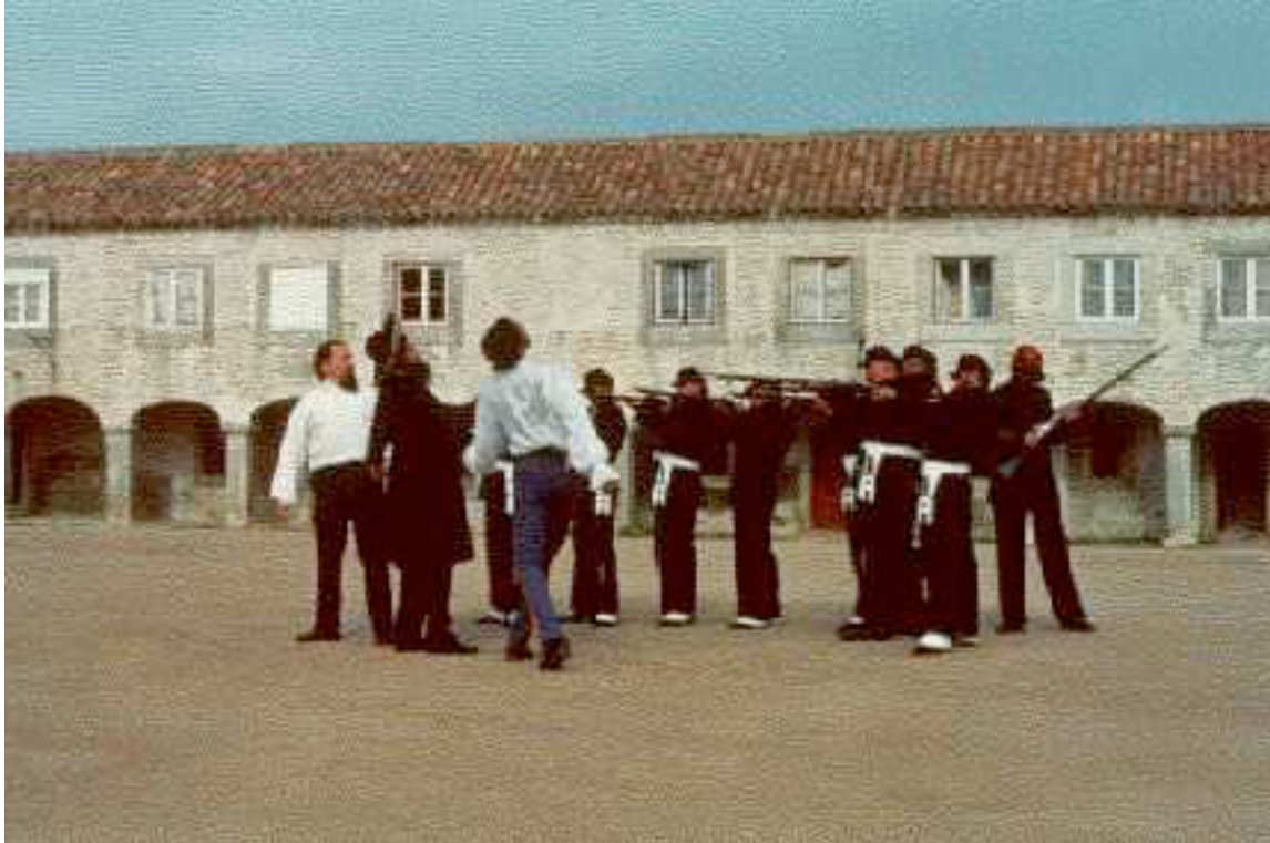
Figure 10 - Scene from 1867: Manet's "Execution of Maximilian"

However, the photo portrayal has a number of problems. First, while it replicates the painting by Manet, it is a distortion of eye witness accounts of the execution. For