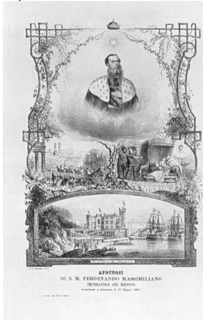
Figure 3 - Apotheosis of H. M. Ferdinand Maximilian, Emperor of Mexico, assassinated at Queretaro on 19 June 1867. An anonymous lithograph (source Wilson -Bareau, 1992: 49).

This is another of the traditional romantic lithographs that circulated after Maximilian's execution. In this depiction, the focus of the viewer is on the spiritual ascent of Maximilian into the afterlife, the ships of empire, the heavenly ascent of the emperor of Mexico into his crowning glory in the afterlife. Note the caption says "assassinated" rather than executed (a empire reading).