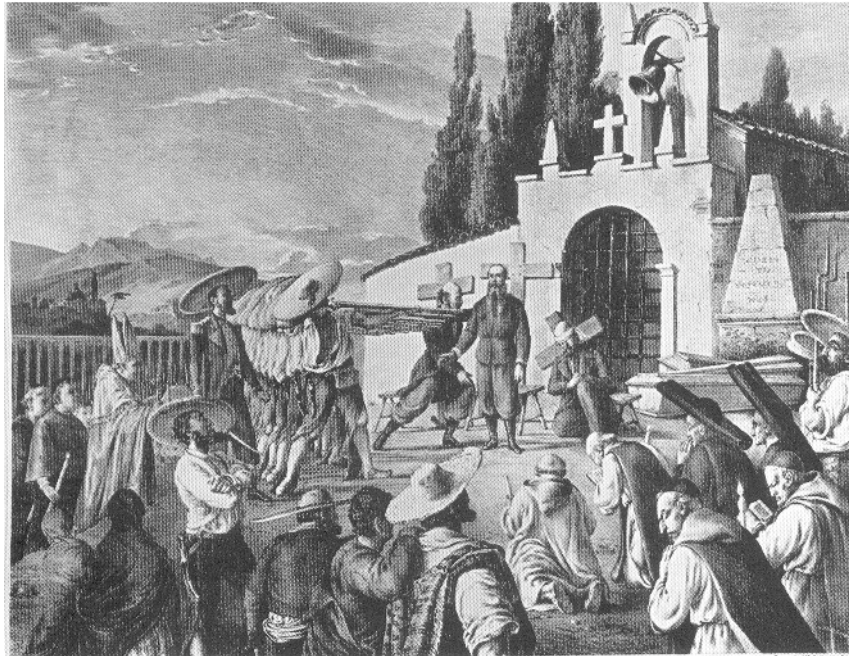
Figure 2 - Lithograph - The Execution of Maximilian , by Goineau

The lithography by Goineau (above) is a romantic aesthetic, centering the attention and the viewing spectators (including the gallery spectator) on Maximilian, with spiritual narrative elements, such as congregates in