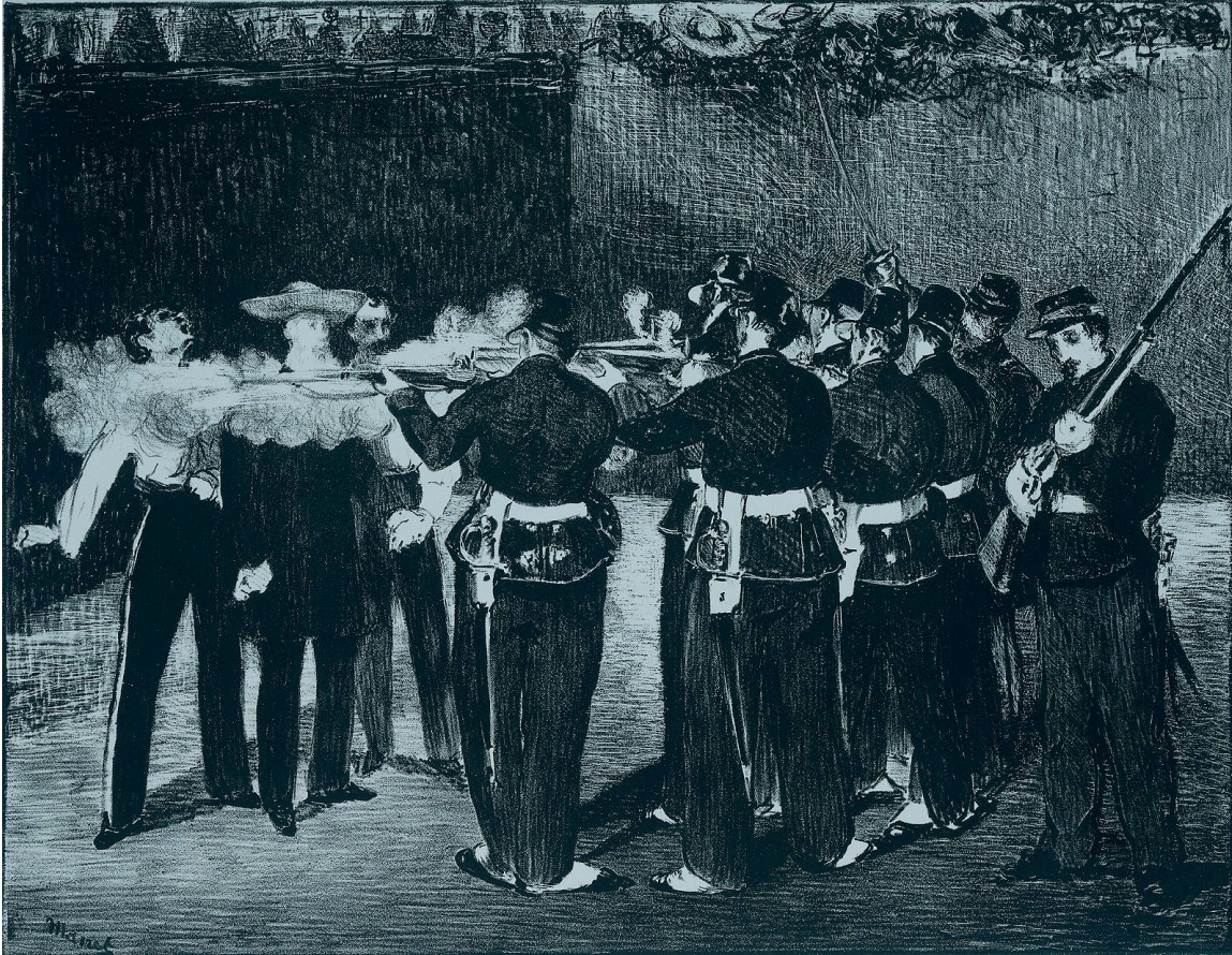
Figure 7 - Execution of the Emperor Maximilian , Edouard Manet, 1868, 33.3x43.3cm, Lithograph , Bibliotheque Nationale, Paris; NYPL, A98458

In the 3rd version of oil, and in the above lithograph, we see that Manet has placed a sombrero on Maximilian's head (and on spectators looking down from the wall). The sombrero invites an iconic interpretation to the painting. For example, it sets up a liminal, betwixt and between space of ambiguity. As Wilson-Bareau (1992: 107) notes, the sombrero could be read as an iconic symbol of martyrdom, especially since Manet (differing from eye witness accounts), places Maximilian between his two generals, as in Christ's crucifixion. On the other hand, such an interpretation is ambiguous, given the