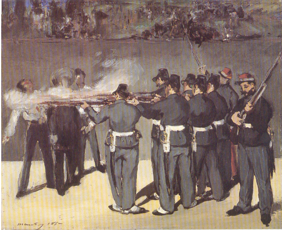
Figure 6 - Manet's 3rd Version in Oil of Execution of the Emperor Maximilian, Third Oil Version, Preparatory oil sketch for 4th & final large oil picture, Edouard Manet, 1868-69, 50x60cm, Oil on canvas, Ny Carlsberg Glyptotek, Copenhagen

The 3rd version, in Copenhagen, is described as a preparatory sketch for the 4th version. The officer with the sword in the third version is omitted in the 4th. A wall appears in the 3rd oil version, and remains in subsequent ones. This could indicate historic detail that circulated in the press, or it can be read more critically as the wall of empire. Before the final (4th) version of the painting, Manet did a