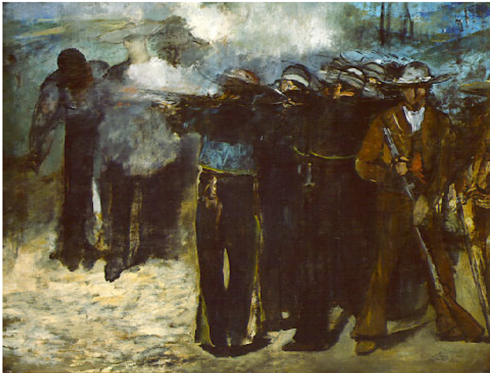
Figure 1 - VERSION 1 - Execution of the Emperor Maximilian, Version 1, Édouard Manet, 1867, 196x259cm, Oil on canvas, Museum of Fine Arts, Boston, A50846; Note nationality of the firing squad

In the first version, the firing squad is dressed in rebel republican uniforms of the Juárez Mexican army. Wilson-Bareau (1992: 61) argues that "the first, unfinished version was