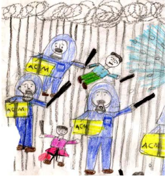
Figure 1: Asylum Seeker Child's Drawing Woomera Detention Centre