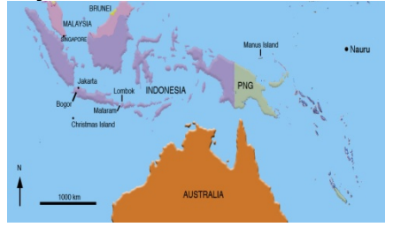
Map by Bernard Shaw, Western Australia, 2009

Figure 2: Island Locations for Australia Asylum Seeker Detention